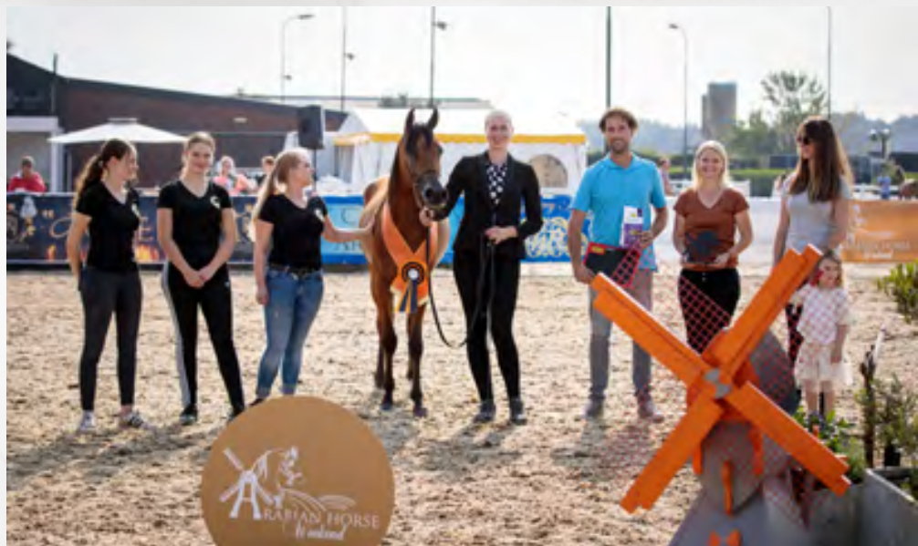
Avicii Lazize AHW 2021